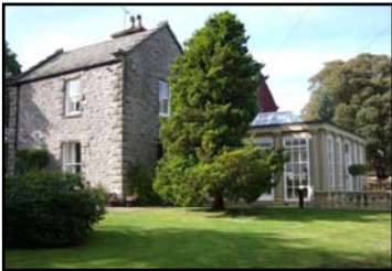
Woodhill Hall, Northumberland www.woodhillhall.co.uk

We've added some great new venues to our list of places that can be used for weddings and other events for next year.