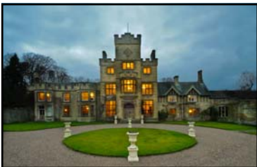
Guyzance Hall, Northumberland www.guyzancehall.co.uk

We have a full list of more venues, please call and ask for a copy.