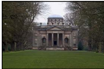
Gibside Chapel & Grounds www.nationaltrust.org